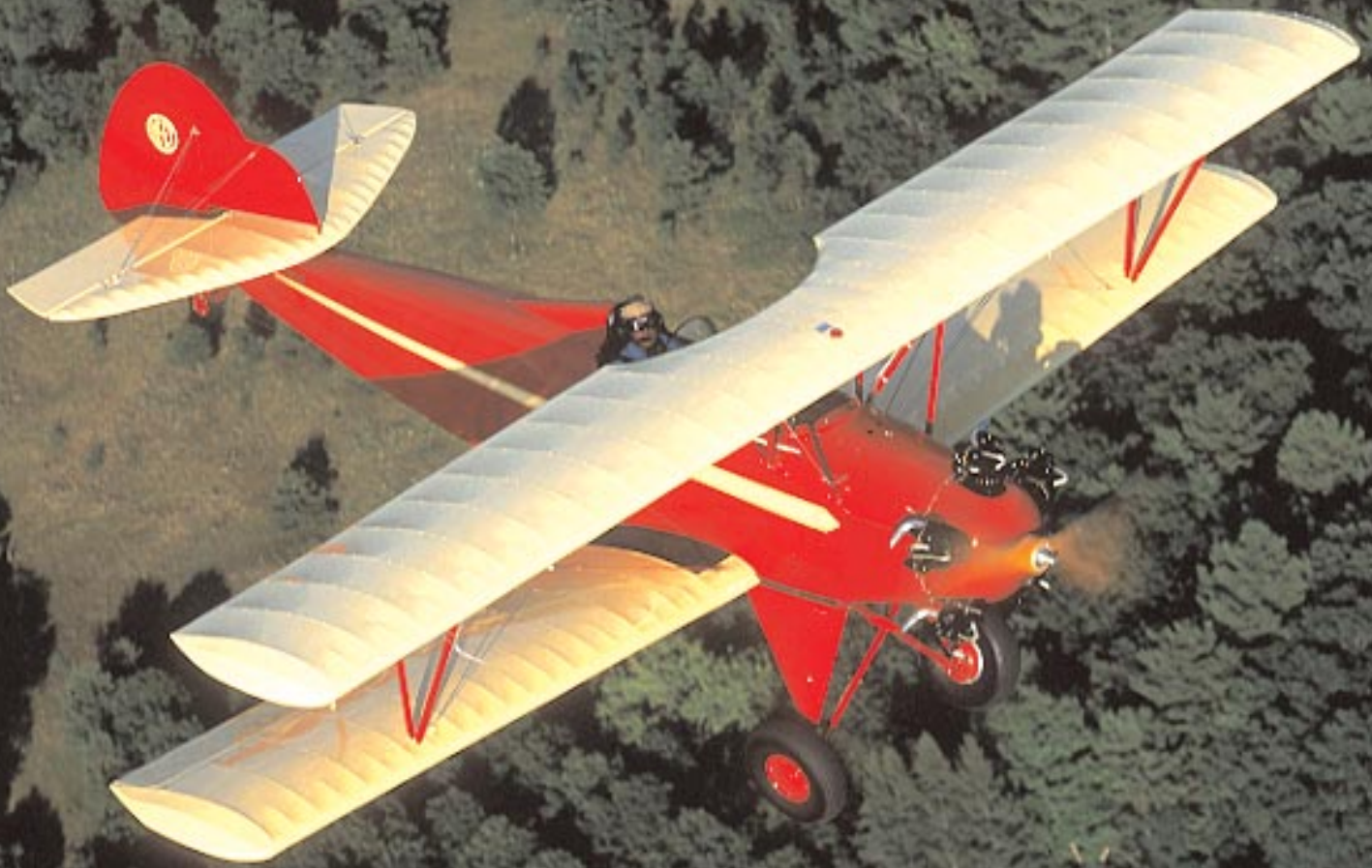
To make it less likely a student could nick a prop or scrape a wingtip, the Fleet was designed with plenty of ground clearance, thanks to a long landing gear. The compact size of the Fleet contrasts sharply with the much larger Stearman used for primary training a decade later.

it in the air. Last year at Oshkosh I met the mechanic who worked with Mantz in 1950 to pull it out of the box and put it together.”