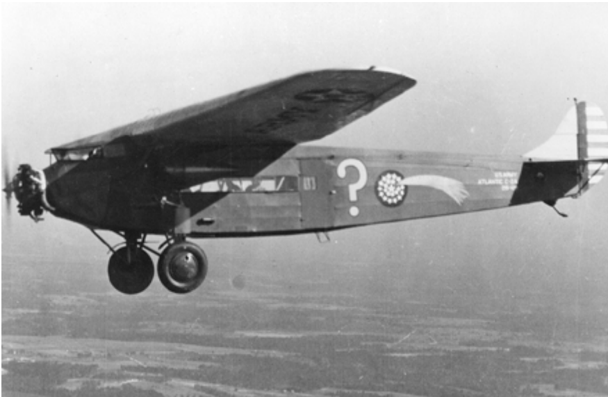
Question Mark was a specially modified Fokker C-2A sporting three powerful and fuel efficient 220-hp radial engines. Modifications included the addition of two 150-gallon fuel tanks as part of the new refueling system.

better to keep the hose far away from the propellers. Supplies—from food to a portable bathtub—came in through the same trapdoor, via rope.