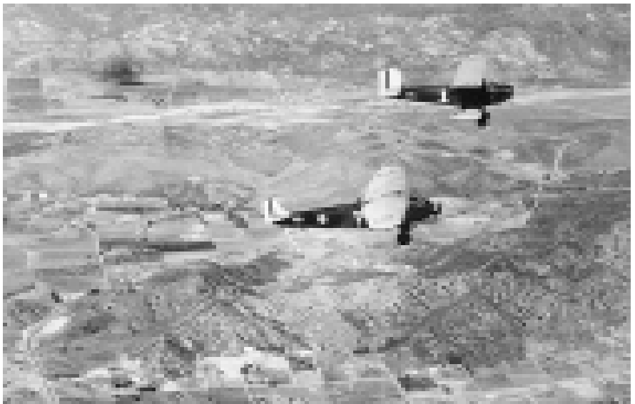
Question Mark’s left engine died Jan. 7 when a pushrod failed, so the crew decided to land. All told, Question Mark’s crew had hooked up with a refueling aircraft 43 times. Question Mark took on 5,660 gallons of fuel and 245 gallons of oil.

On the next refueling attempt, Spaatz appeared in the hatch stark naked, except for a parachute har-