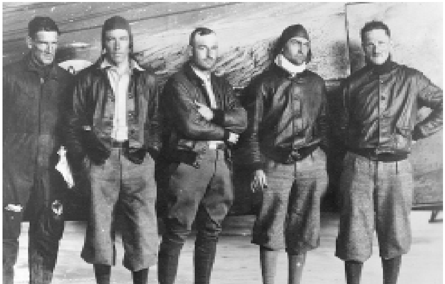
Sgt. Roy Hooe, 2nd Lt. Elwood Quesada, 1st Lt. Harry Halverson, Capt. Ira Eaker, and Maj. Carl Spaatz pose with their aircraft after a week in the air. All were awarded the Distinguished Flying Cross.

Question Mark inspired many imitators, and, by year's end, they had made more than 40 attempts to break