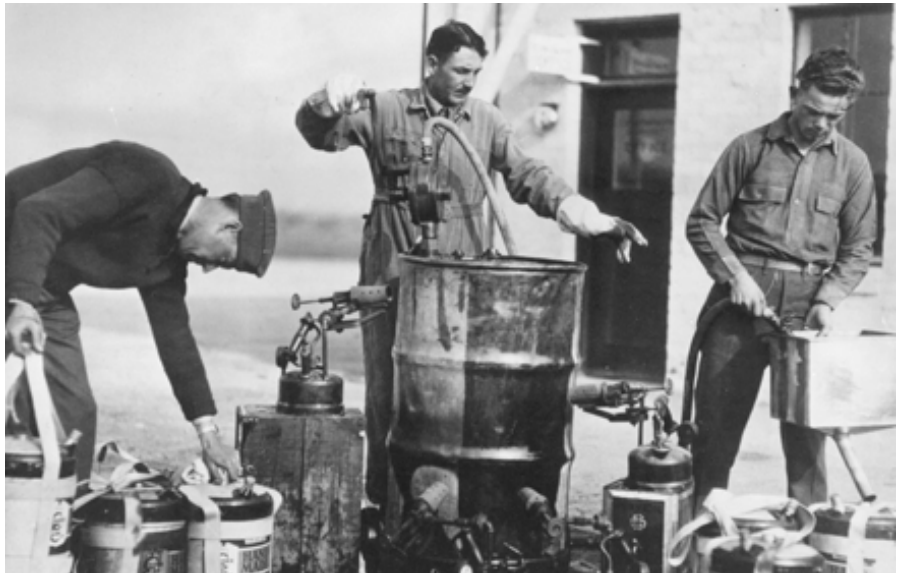
A ground crew prepares preheated oil in five-gallon cans that the refueling aircraft will lower through the hatch of Question Mark .

Access to the airplane's fuel receptacle was gained through a trapdoor placed behind the wing, the