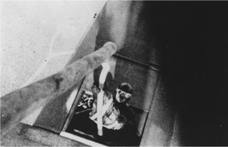
Maj. Carl Spaatz stretches through the trapdoor at the top of Question Mark to grasp the refueling hose for a fuel transfer. The transfer was messy—Spaatz was sprayed by fuel on several occasions.

contacts, transferring 600 gallons. The process became more difficult as the tanker off-loaded fuel to Question Mark , which had to go into a slight descent to stay well above the stall speed.